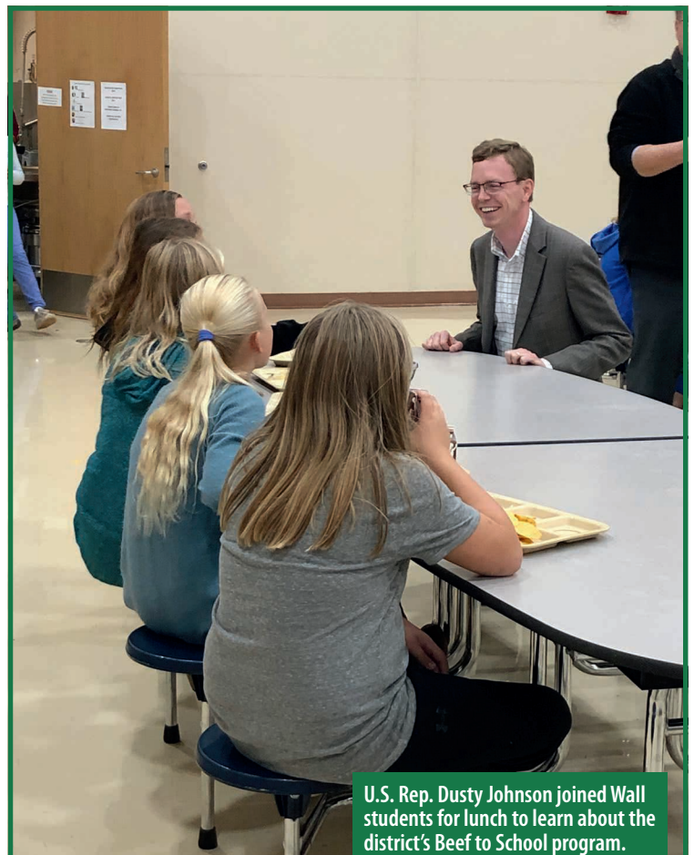
U.S. Rep. Dusty Johnson joined Wall students for lunch to learn about the district's Beef to School program.

In 2018, Wall Meats Processing partnered with the school, Wall FFA and the Ag Committee of Wall Economic Development Corporation to plan and implement the project. Three months later, ranchers began donating the beef and Wall Meat Processing contributed the cost of processing and delivering. This community partnership has grown more effective and continues to provide