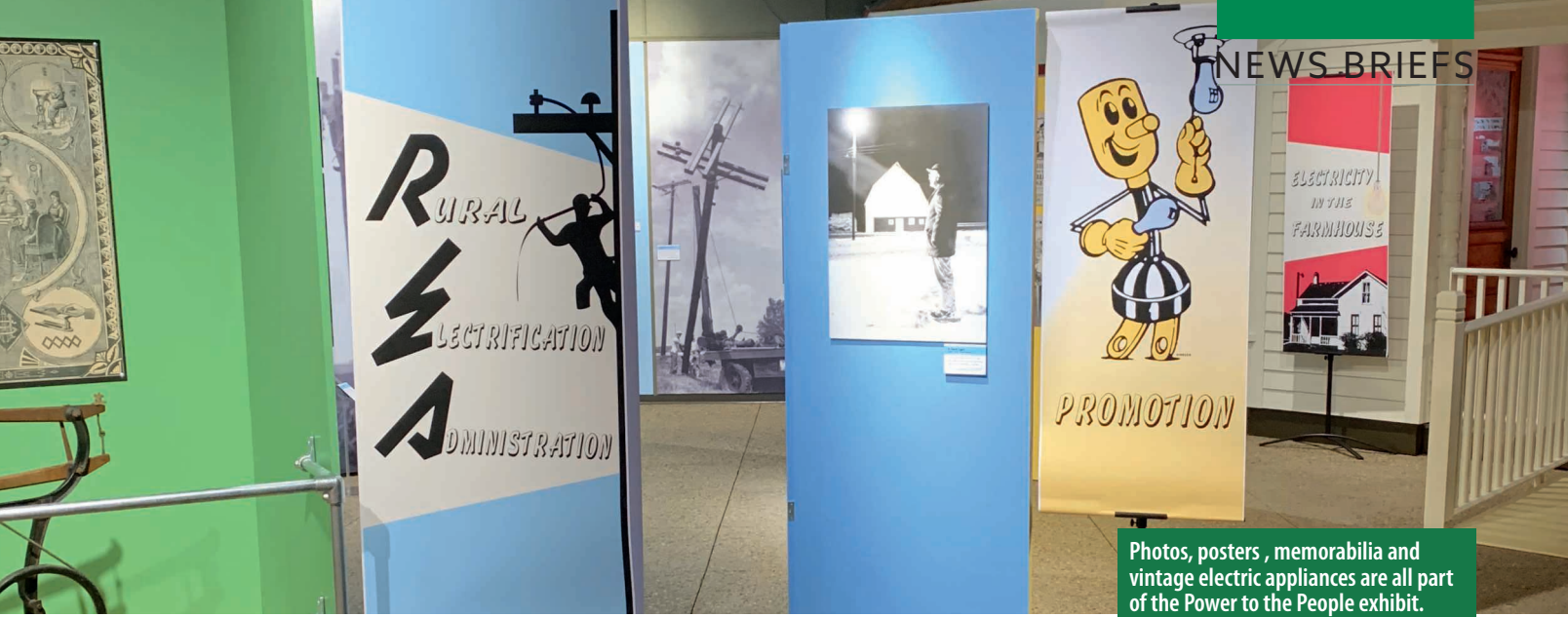
Photos, posters, memorabilia and vintage electric appliances are all part of the Power to the People exhibit.