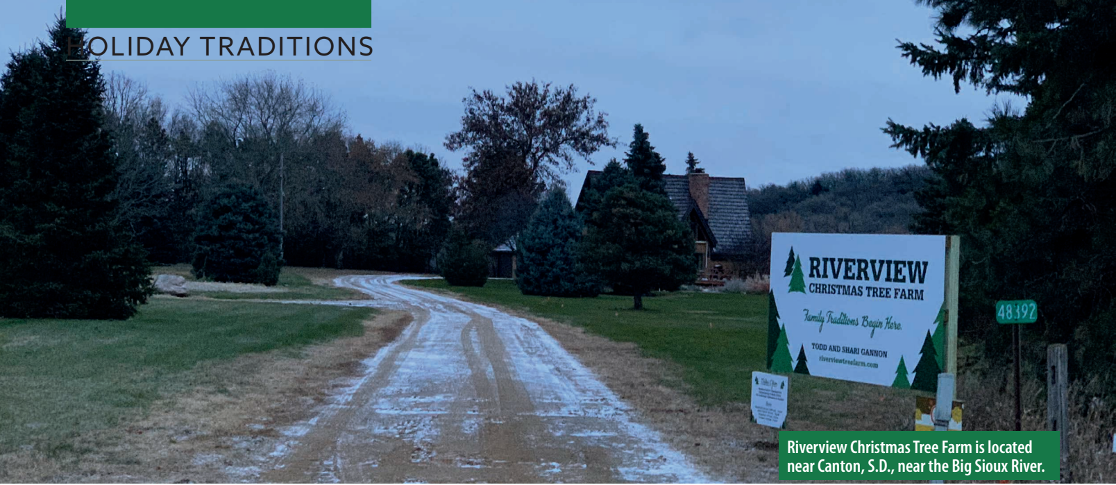
Riverview Christmas Tree Farm is located near Canton, S.D., near the Big Sioux River.