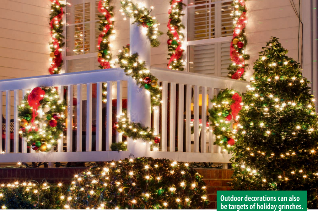
Outdoor decorations can also be targets of holiday grinch.