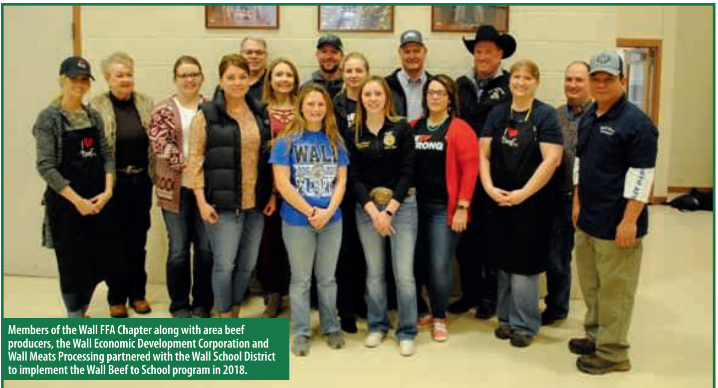
Members of the Wall FFA Chapter along with area beef producers, the Wall Economic Development Corporation and Wall Meats Processing partnered with the Wall School District to implement the Wall Beef to School program in 2018.