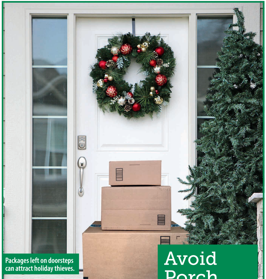
Packages left on doorsteps can attract holiday thieves.