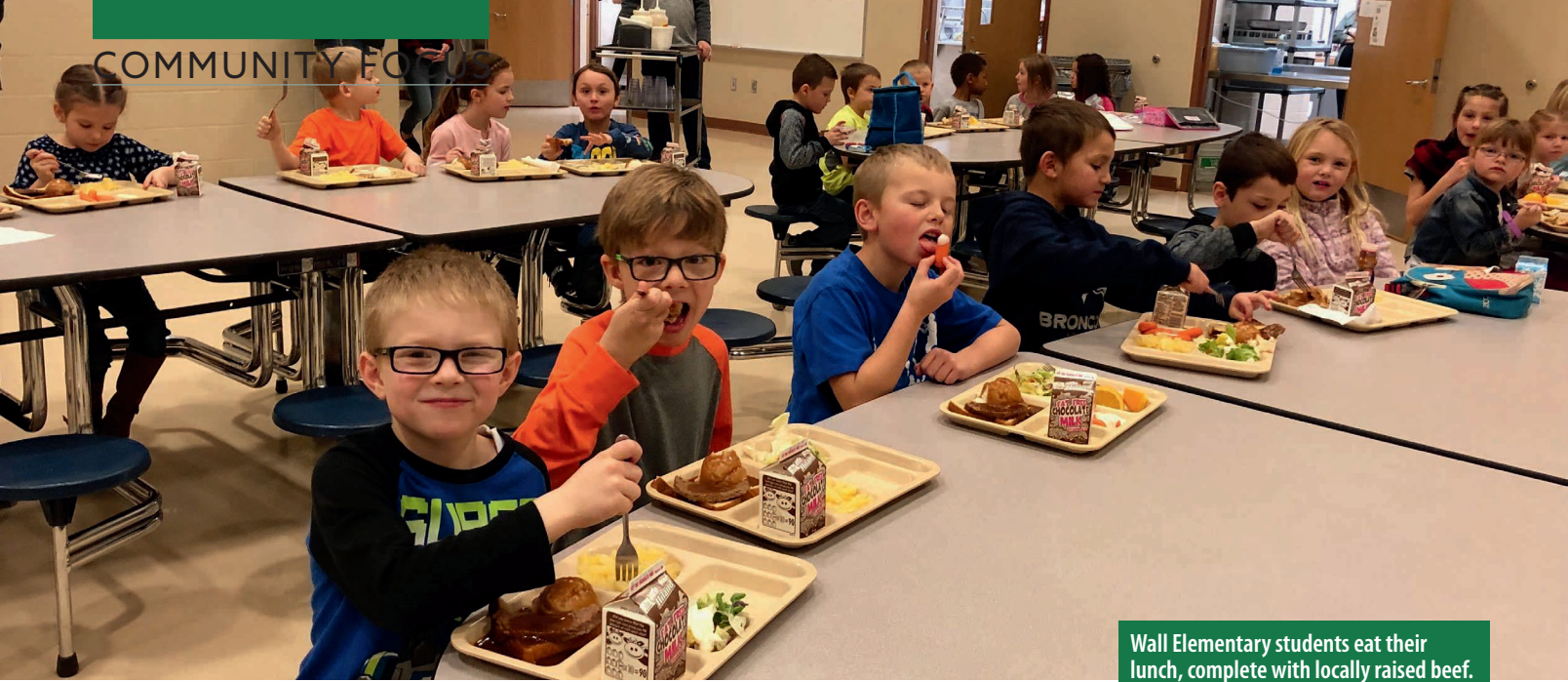
Wall Elementary students eat their lunch, complete with locally raised beef.