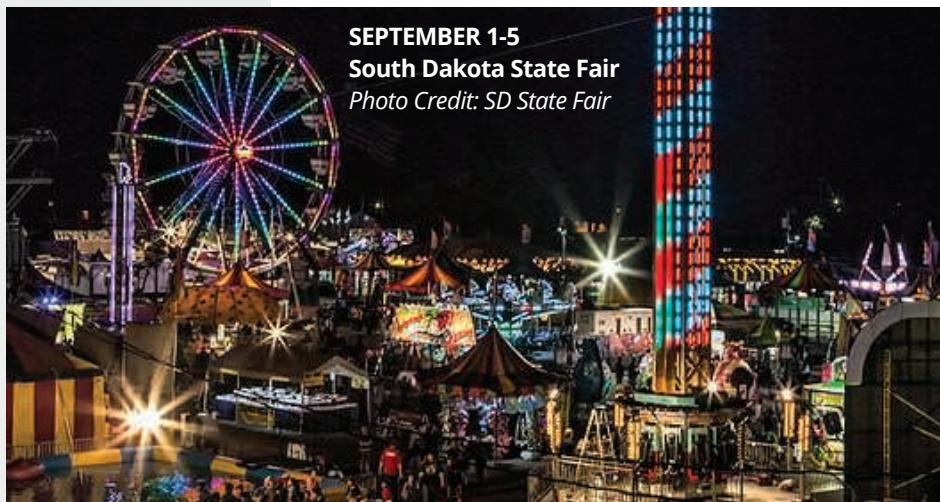
SEPTEMBER 1-5 South Dakota State Fair

To have your event listed on this page, send complete information, including date, event, place and contact to your local electric cooperative. Include your name, address and daytime telephone number. Information must be submitted at least eight weeks prior to your event. Please call ahead to confirm date, time and location of event.