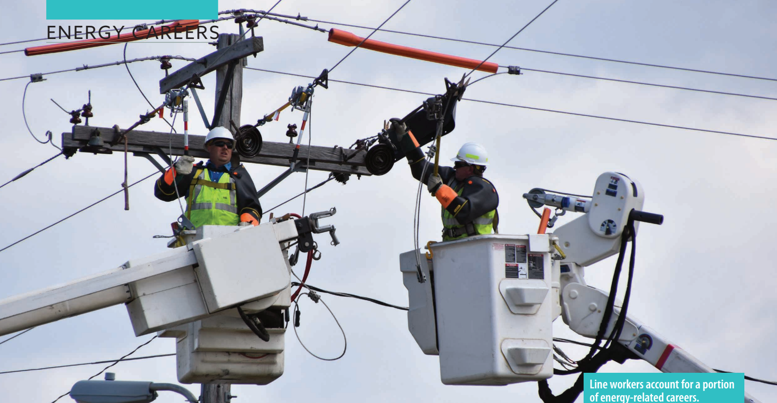
Line workers account for a portion of energy-related careers.