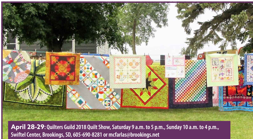
April 28-29: Quilters Guild 2018 Quilt Show, Saturday 9 a.m. to 5 p.m., Sunday 10 a.m. to 4 p.m., Swiftel Center, Brookings, SD, 605-690-8281 or mcfarlas@brookings.net

Hats Off to the Artists Art Show, Faulkton, SD, 605-598-4160