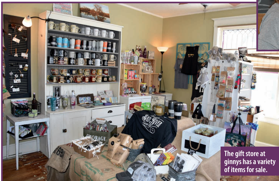
The gift store at ginnys has a variety of items for sale.