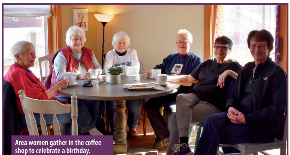
Area women gather in the coffee shop to celebrate a birthday.