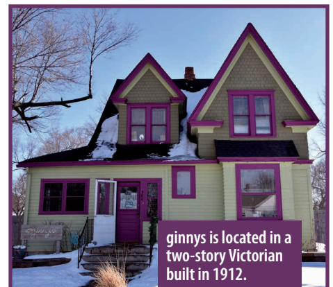
ginnys is located in a two-story Victorian built in 1912.